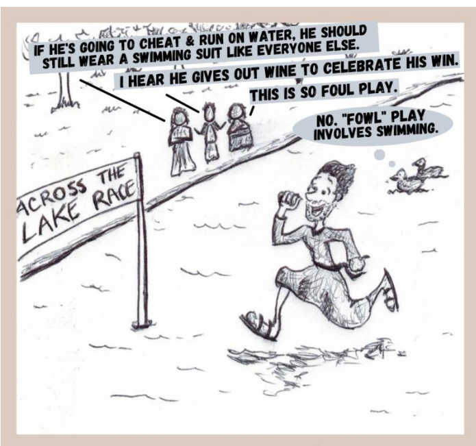
Even as a teenager, Jesus couldn't help but make enemies.