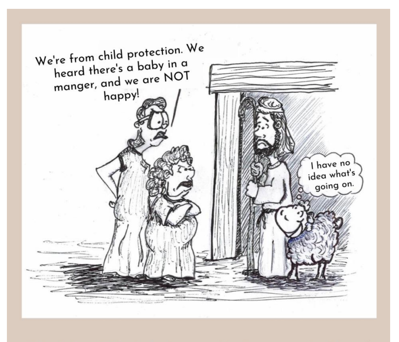
Why the best Bible stories happened long ago - even God doesn't want to deal with red tape.

This Christmas, may you find ways to be blessed and to bless those around you as you experience love in an incredible way.